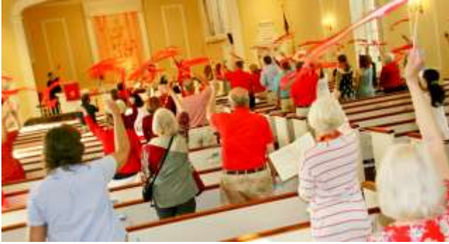
Pentecost Sunday (2021)