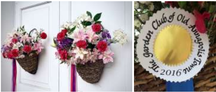
May baskets and awards adorn campus doors!