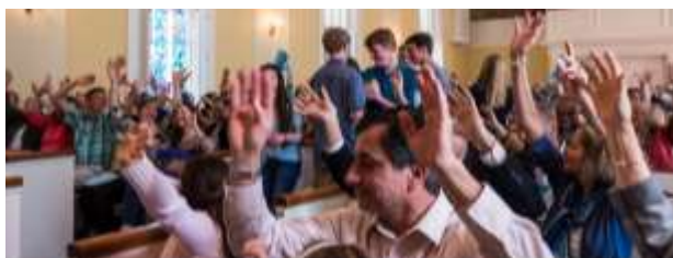
Youth Sunday (2017)