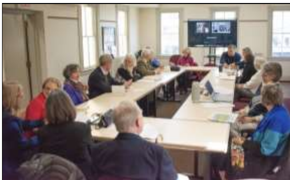
Adult Ed Sunday mornings