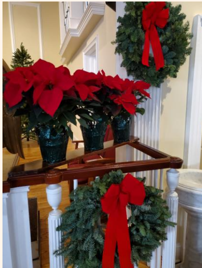
Poinsettias in the Sanctuary